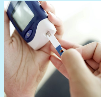
Table 1 – Preferred Diabetes Supply List effective for DOS on or after January 1, 2017

The Indiana Family and Social Services Administration (FSSA) has selected Abbott Diabetes Care, Roche Diabetes Care, and Trividia Health as preferred vendors to provide blood glucose testing monitors and blood glucose testing strips for the Indiana Health Coverage Programs (IHCP). Effective January 1, 2017, the Preferred Diabetes Supply List (PDSL) in Table 1 will be effective for all IHCP programs, subject to limitations established for certain benefit packages. The PDSL applies to claims with dates of service (DOS) on or after January 1, 2017.